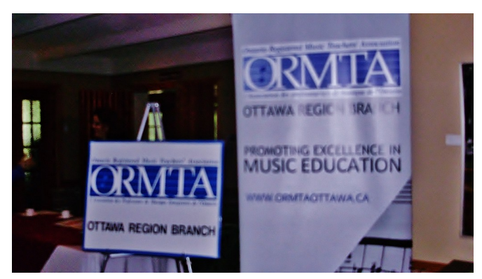
The new ORMTA Ottawa sign was displayed, along side the old ORMTA Ottawa sign. The new sign is bigger, easy to move and set up, and was designed to match with our other publicity. Thanks to Sandy Menard for making this possible.