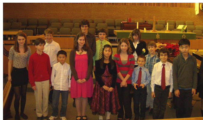
Variety Show Participants

All levels and all styles of piano playing are welcome. Please contact Liz Watford at e_j_watford@yahoo.co.uk (that's eee underscore jay underscore watford)