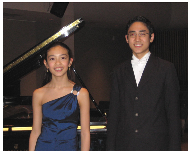
Young Artist First Place Winner and Runner-Up