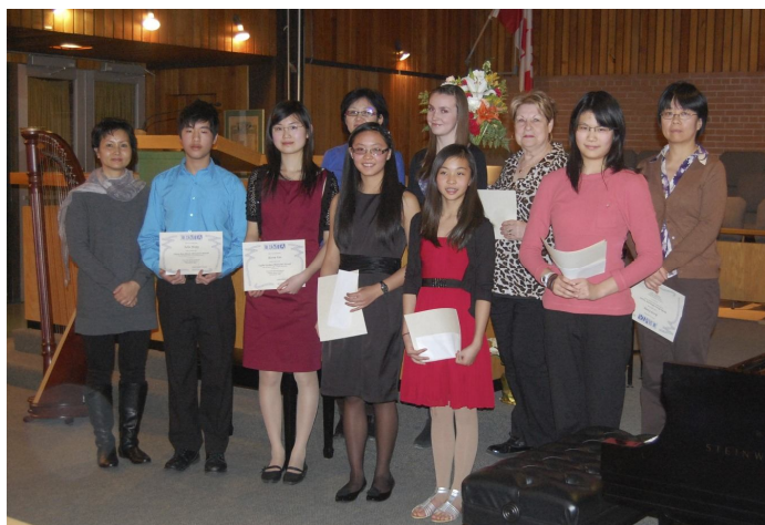
First Class Honours Scholarships Winners