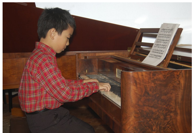
Checking out the pianoforte