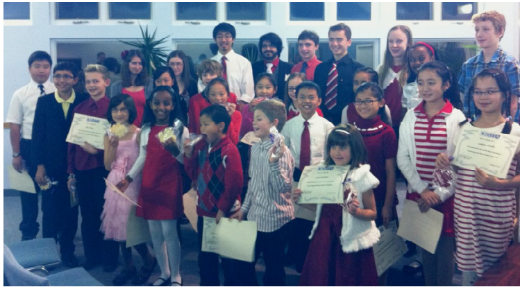
A group of happy Recital Participants