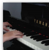
DISKLAVIER EN Pianos that record and play by themselves

The Royal Conservatory The finest instrument is the mind.