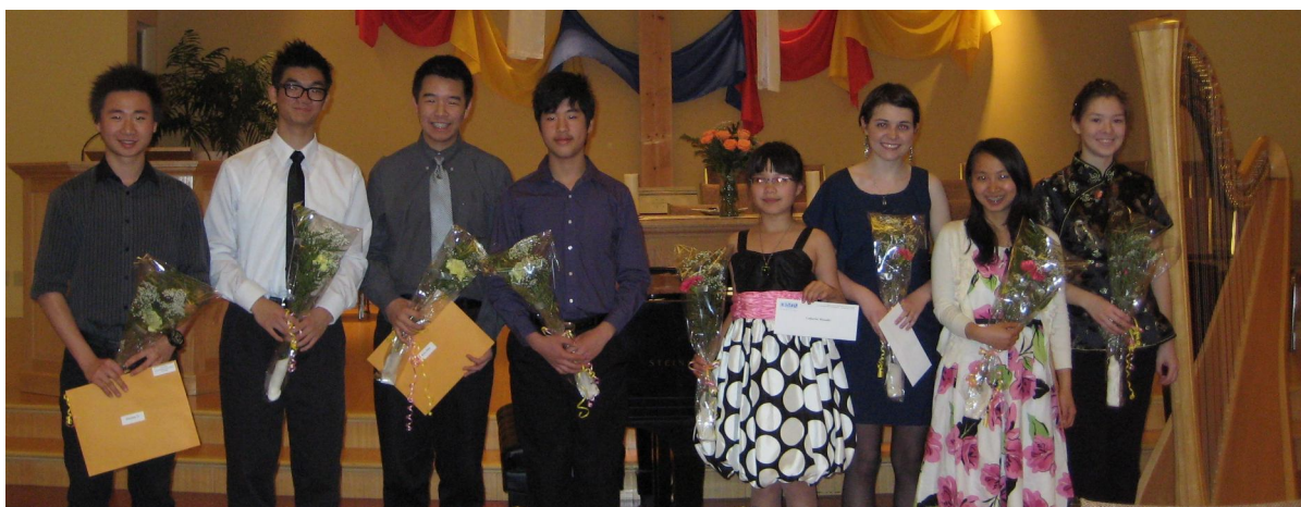
Gala participants (see story on page 14)